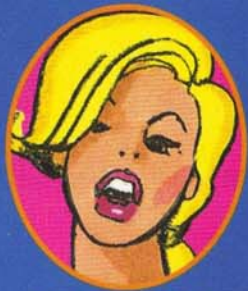
FAYE RUSSELL Glamorous Hollywood Star